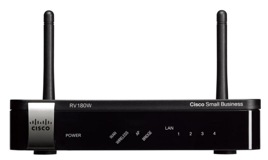
Figure 1. Cisco RV180W Multifunction VPN Router (Front Panel)