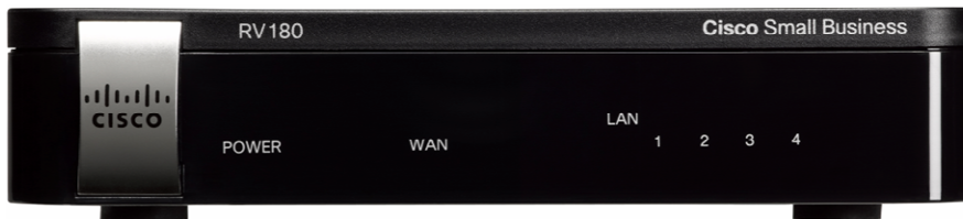
Figure 1. Cisco RV180 VPN Router (Front Panel)

Secure, high-performance connectivity at a price you can afford.