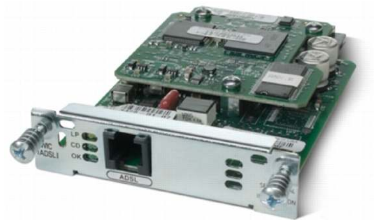
Figure 1. Single-Port HWIC Provides ADSL Port for Connectivity

Both the 1-port and 2-port HWIC cards are supported on the Cisco 1841, 1861, 2801, 2811, 2821, 2851, 3825, and 3845 ISRs. The 1-port HWICs are supported starting with Cisco IOS Software Release 12.4(4)T and the 2-port HWICs are supported starting with Cisco IOS Software Release 12.4(6)T.